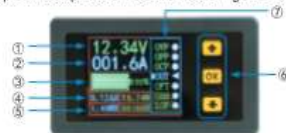
Figure 1 Meter's Front Panel of SIN9020S

This instrument is a split structure, composed of two parts, meter and power expansion board. The front panel is as Figure 1 while the power expansion board is as Figure 2.